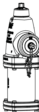
Series 2712 1 Pumper

American AVK Company an ISO 9001-2000 registered company